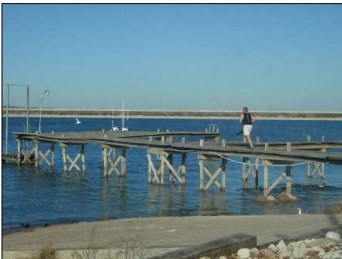
"Who is that running on the dock ? It's the Captain!"