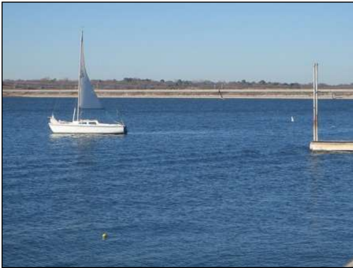
"FREE AT LAST!! FREE AT LAST!! I'm heading for the BVIs."